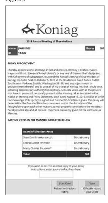
Figure 5) describing how your proxy will be voted. You can also click "Start Over" to revise your Internet Proxy.

Figure 5: Once you are satisfied with your Internet Proxy, and you wish to have a copy of the summary page, enter your email address. By clicking "Vote" your instructions are recorded. A copy of the Internet Proxy is automatically transmitted to the Ballot Tabulator.